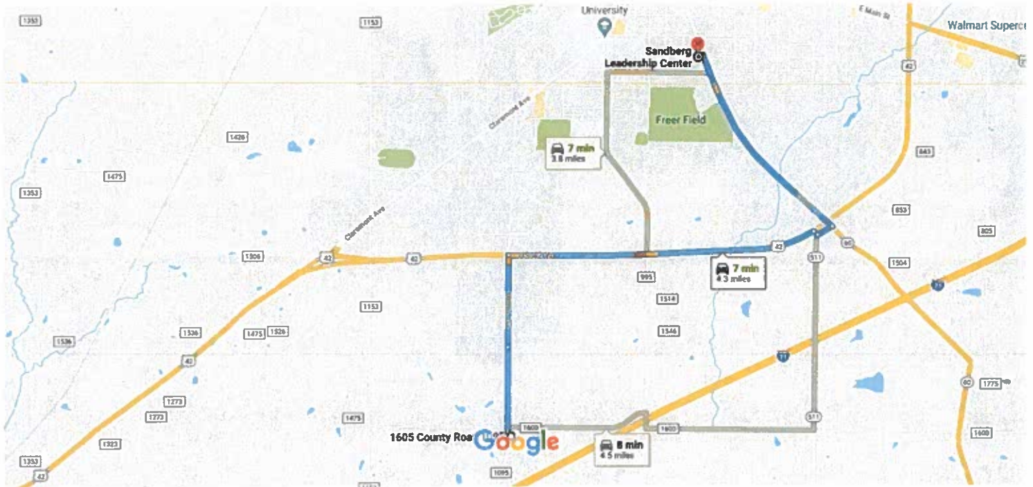
Map data ©2020 2000 ft